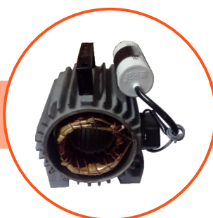
CI FG-260 Grade